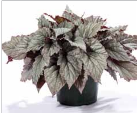
'Shadow King Cool White'