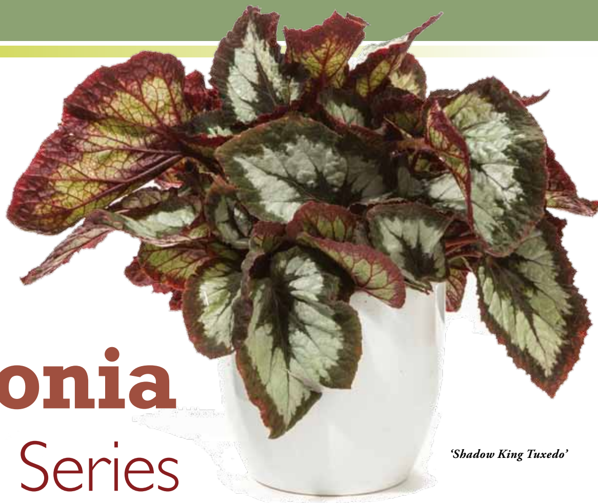
'Shadow King Tuxedo'