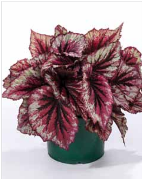
'Shadow King Cherry Mint'

75 percent. For high light regions of the country like the southwest, year round protection would be necessary. Excessively high light levels can cause stunting of plants and scalding of leaves.